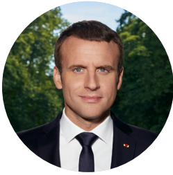
Emmanuel Macron President of the French Republic

The French Presidency of the Council of the European Union is coming to a close. Here we take stock and measure the new challenges we have had to respond to collectively in recent months, with all the determination and ambition that were needed.