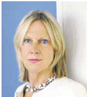
Brigitte GRÉSY (France) President of the High Council for Gender Equality