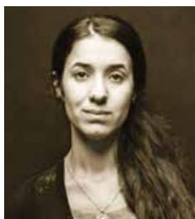
Nadia MURAD (Iraq) Iraqi Yazidi human rights activist, awarded the 2018 Nobel Peace Prize