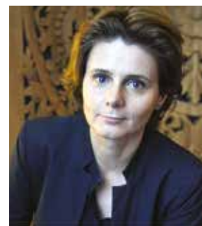
Caroline FOUREST (France) Writer, editor, film director