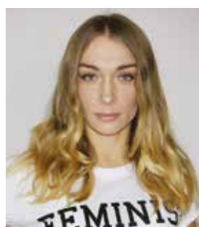
Inna SHEVCHENKO (Ukraine) Activist, Femen