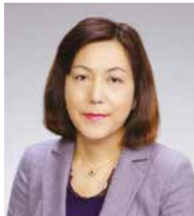
Yoko HAYASHI (Japan) Lawyer and former president of the Committee on the Elimination of Discrimination against Women