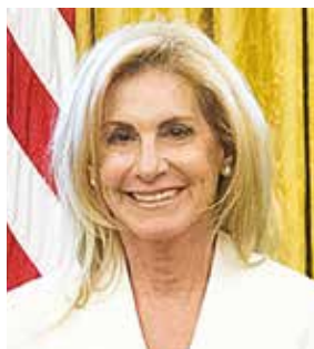
Jamie D. McCOURT (USA) Business woman and Angel Investor, Ambassador of the United States of America to the French Republic and the Principality of Monaco