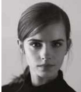
Emma WATSON (United Kingdom) Actor and activist, Goodwill Ambassador for UN Women