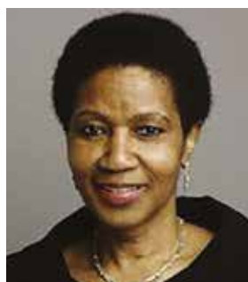
Phumzile MLAMBO-NGCUKA (South Africa) Former Deputy President of South Africa, Under-Secretary-General of the United Nations and Executive Director of UN Women