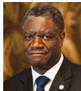
Denis MUKWEGE (Democratic Republic of Congo) Gynecologist, human rights activist, awarded the 2018 Nobel Peace Prize