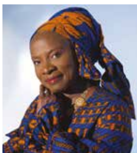
Angélique KIDJO (Benin) Singer, composer, Grammy Awards winner and UNICEF Goodwill Ambassador