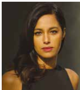
Rula JEBREAL (Italy-Israel-Palestine) Journalist, author, and foreign policy analyst