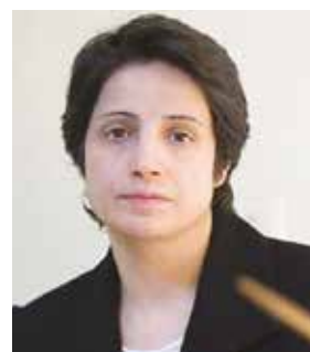
Nasrin SOTOUDEH (Iran) Lawyer and human rights activist. Honorary member of the Gender Equality Advisory Council