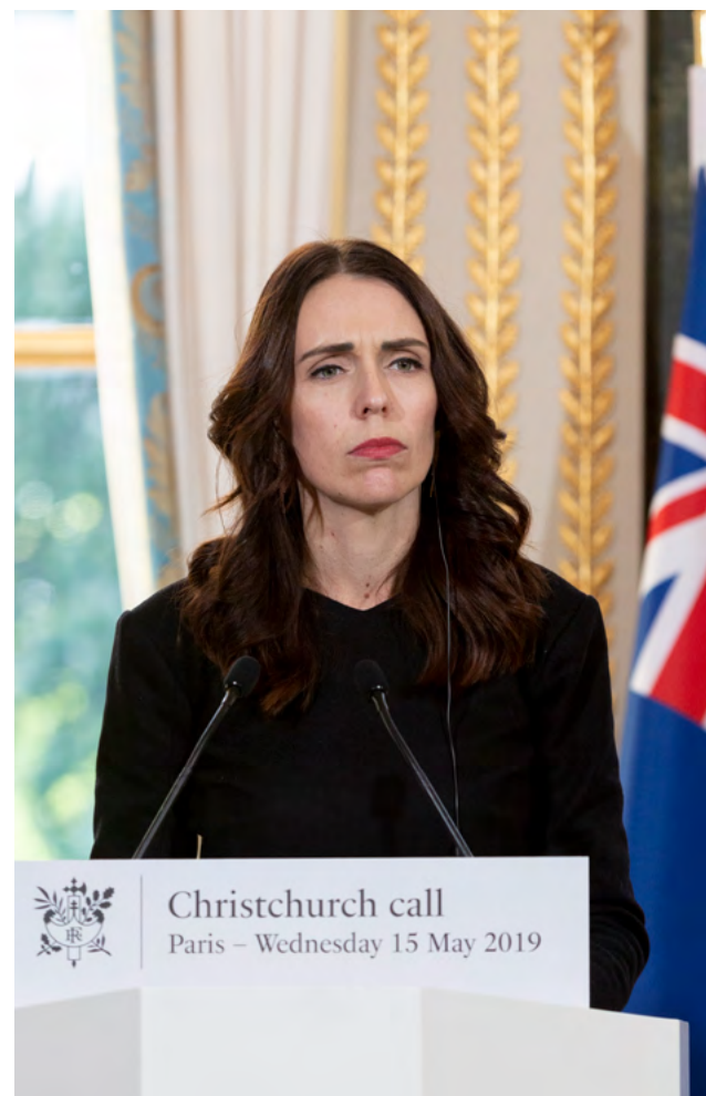
Elysée Palace, press conference after the launching of the Christchurch Call with Jacinda ARDERN, Prime minister of New Zealand.

Charter for an Open, Free and Safe Internet: To fight hate speech, cyber bullying and online terrorism, the French G7 Presidency calls for the joint adoption of a Charter for an Open, Free and Safe Internet by governments, the private sector and civil society. This charter aims to create a collective movement guaranteeing transparency and cooperation for the safe and positive use of the Internet. It builds on the Christchurch call by widening the scope of commitments made by platforms, particularly in terms of taking down content, moderating, ensuring transparency and supporting victims. The Charter will be signed by major digital stakeholders in Paris on 23 August, before being presented to the G7 States in Biarritz.