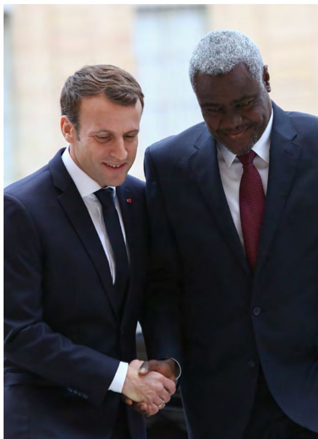
Emmanuel Macron, President of France, next to Moussa FAKI, Chairperson of the African Union Commission.

This format will help identify new solutions to two key challenges for African political and economic stability: the situation in the Sahel, a region where all the challenges the continent faces intersect, and promotion of women's entrepreneurship across the whole continent.