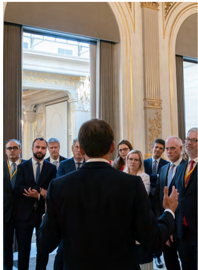
Meeting with the G7 Sherpas on the 13th of June of 2019.

The G7 is not just a discussion forum. It has been behind very concrete achievements including the creation of the Financial Action Task Force (FATF), the European Bank for Reconstruction and Development (EBRD), the Global Fund to Fight AIDS, Tuberculosis and Malaria, and the Muskoka Initiative to reduce maternal and infant mortality.