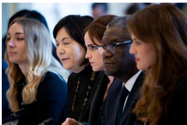
G7 Gender Equality Advisory Council, on the 19th of February 2019

For further information on the G7 Gender Equality Advisory Council and its members, visit: https://www.elysee.fr/en/g7/advisory-council