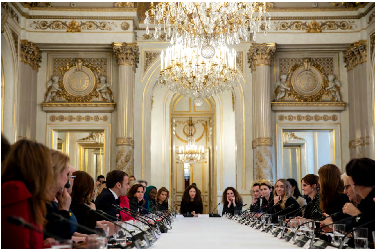
G7 Gender Equality Advisory Council, on the 19th of February 2019

Lastly, solutions promoted and implemented by local stakeholders from Biarritz, the Basque country, the Pyrénées-Atlantiques Department, and the Nouvelle-Aquitaine Region, will be highlighted. Three debates have already been organized in the Basque country on the themes of combating inequality and protection of biodiversity and oceans.